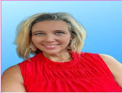
American Legion Auxiliary 2024-2025 Department President