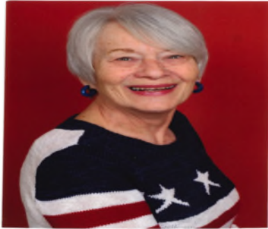
American Legion Auxiliary 2023-2024