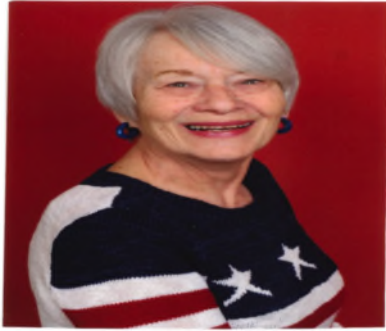
American Legion Auxiliary 2023-2024