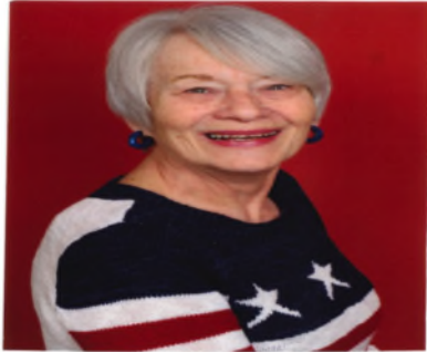
American Legion Auxiliary 2023-2024