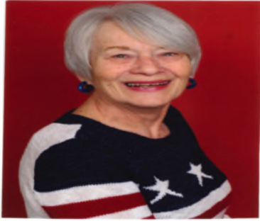
American Legion Auxiliary 2023-2024

“With Love and Gratitude~~We Support Our Military & Honor Our Veterans”