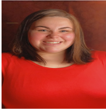
American Legion Auxiliary 2022-2023 Department President