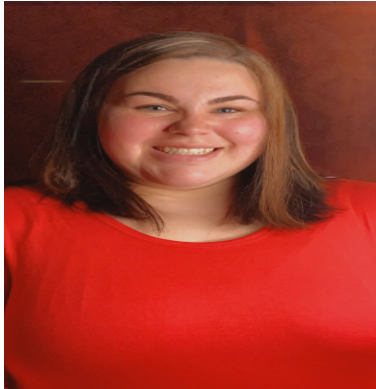
American Legion Auxiliary 2022-2023 Department President