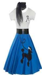
Korea Era 6/25/50-1/31/55