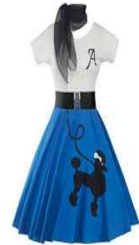
Korea Era 6/25/50-1/31/55