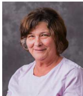
American Legion Auxiliary 2019-2021 Department President

“Building Memories for Our Future American Legion Auxiliary while Loving Our Veterans Everyday”