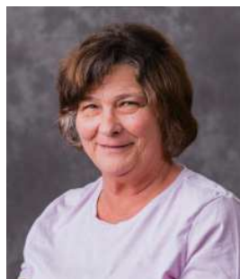
American Legion Auxiliary 2019-2021 Department President

“Building Memories for Our Future American Legion Auxiliary while Loving Our Veterans Everyday”