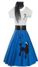
Korea Era 6/25/50-1/31/55