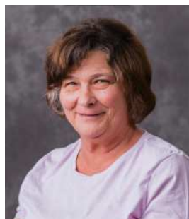
American Legion Auxiliary 2019-2020 Department President

“Building Memories for Our Future American Legion Auxiliary while Loving Our Veterans Everyday”