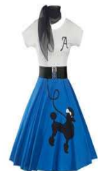
Korea Era 6/25/50-1/31/55