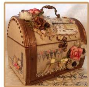
Secretary/ Treasure (Hope Chest)

American Legion Auxiliary National Website ALAforveterans.org