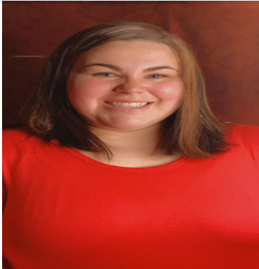
American Legion Auxiliary 2022-2023 Department President