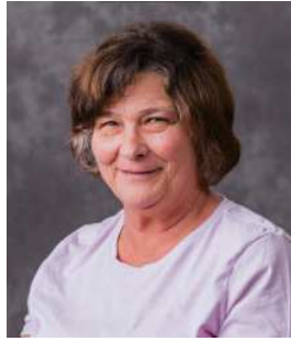
American Legion Auxiliary 2019-2021 Department President

“Building Memories for Our Future American Legion Auxiliary while Loving Our Veterans Everyday”