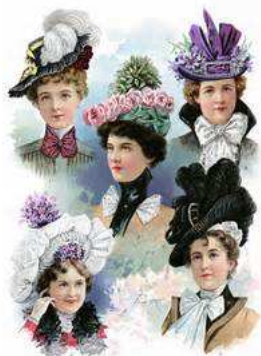
New Designs in Spring Hats THE DRESSMAKER APRIL, 1906